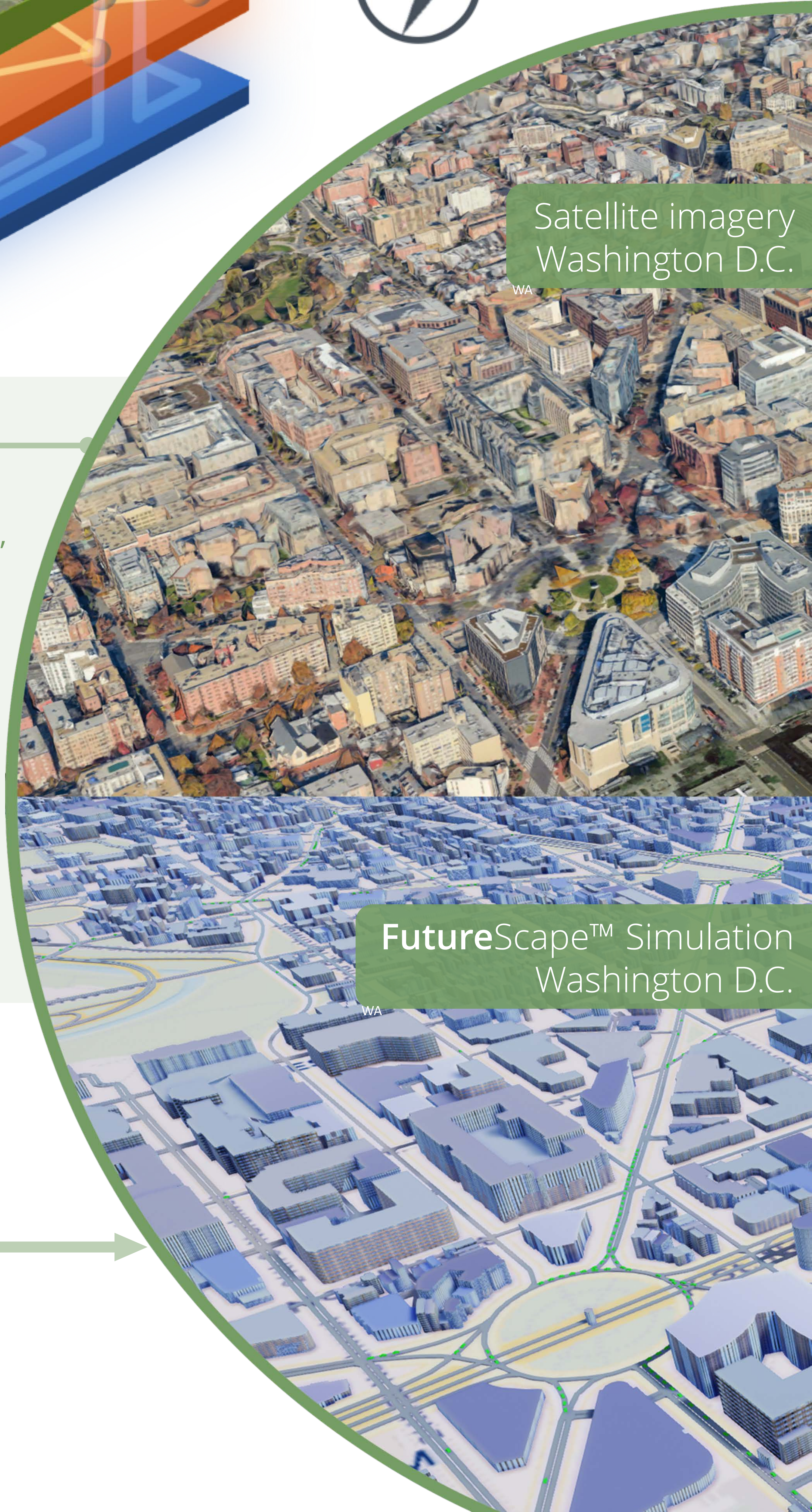
Satellite imagery Washington D.C.