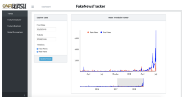
Trend of tweets posting fake and real news in Twitter

We construct and publicize a multi-dimensional data repository FakeNewsNet , which currently contains two datasets with news content, social context, and spatiotemporal information. The constructed FakeNewsNet repository has the potential to boost the study of various open research problems related to fake news study. First, the rich set of features in the datasets provides an opportunity to experiment with different approaches for fake news detection, understand the diffusion of fake news in social network and intervene in it. Second, the temporal information enables the study of early fake news detection by generating synthetic user engagements from historical temporal user engagement patterns in the dataset. Third, one can investigate the fake news diffusion process by identifying provenances, persuaders, and developing better fake news intervention strategies. Our data repository can serve as a starting point for many exploratory studies for fake news, and provide a better, shared insight into disinformation tactics. Because of Twitter's policy, we cannot disclose the entire dataset and hence we provide API's in the Github repository to collect the entire dataset.