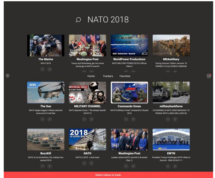
Fig2. YouTubeTracker Search Page

comments and subscribers over time. This can track viewer's interest in a specific topic over time in an easily understandable manner, which lets analysts measure interest in current events.